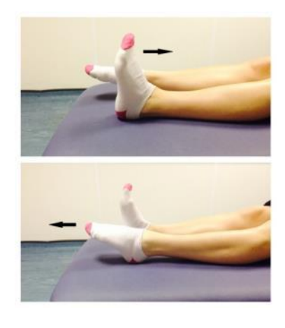
Point your foot up and down. Repeat this 10 times.

Do these exercises 3-4 times a day. Start straight away, you do not need to push into pain.