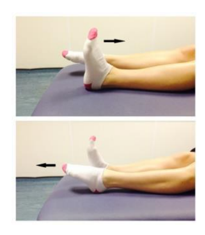
Point your foot up and down. Repeat this 10 times.

Do these exercises 3-4 times a day. Start straight away, you do not need to push into pain.