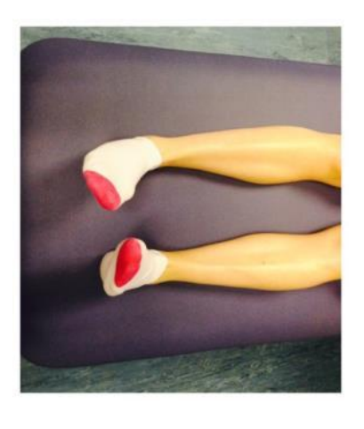
3. Make gentle circles with your foot in one direction and then the other direction. Repeat this 10 times.